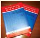
Korean- Nepali- English Dictionary