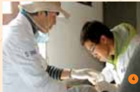
From top left: Photo 1-Medical camp team, Photo 2 & 3-KOICA volunteers checking the patients, photo 4- KOICA volunteers conducting surgical operation in the medical camp.