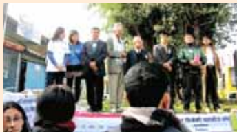
Inauguration of Pokhara Volunteer Caravan