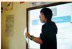
Training program for Nepali teachers working for the special education field