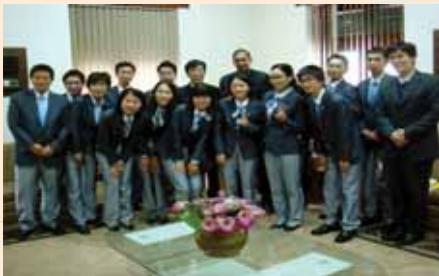
The last group of volunteer for 2011 in educational and cultural visit

KOICA Nepal Office has designed a special training program for these volunteers, which starts immediately after their arrival. This training lasts for 8 weeks and focuses mainly on learning and understanding the Nepali history, language, and culture. Volunteers attend series of lectures on Nepalese economy and social structure as well. During this period, they visit cultural sites, which will help them to understand the local environment and localities. This training also includes on the job training in their respective organizations to familiarize them with their new working environment. This 8 weeks time is an intensive study time and field work for the volunteer where they receive knowledge about Nepal and its people through interaction, visits, home stay program etc. This type of training was organized four times in 2011.