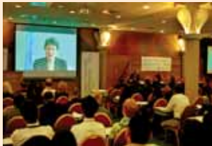
UNDP Administrator Helen Clark spoke to the delegates via video message at the opening ceremony of GVC-2011.