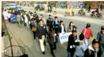
Volunteer Caravan in Kathmandu

With a spirit of celebrating IYV+10, KOICA actively participated in the Volunteer Caravan organized by National Steering Committee for Volunteerism Nepal (NSCVN). Many volunteers participated in Kathmandu, Pokhara, Hetauda, and Nepalgunj Volunteer Caravan. As the member of NSCVN, KOICA financially as well as technically supported the Volunteer Caravan. KOICA volunteers actively took part in Kathmandu Volunteer Caravan and other 3 regional Volunteer Caravans.