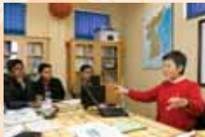
Korean Language Class in Biswo Bhasha Campus, Kathmandu

The volunteers who are working in the Biswo Bhasha Campus of Nepal (Campus of International Language) published a dictionary for the Korean Language Students studying in the campus. This dictionary is based on the language books of Kyung Hee University, Korea (Basic-level 1-2, Mid-level 1-2, High Level 1-2) and has total 5,489 words. Viewing the growing craze of Korean language and culture in Nepal, KOICA has been providing language instructor to this campus for a very long time.