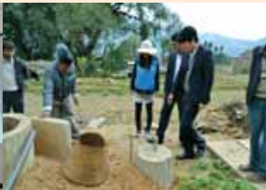
KOICA Volunteers inspecting the Biogas System