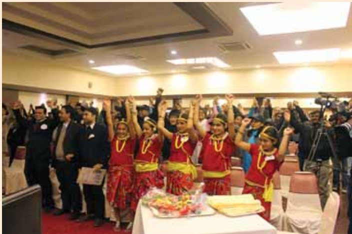
Participants expressing their solidarity for volunteerism in the conference