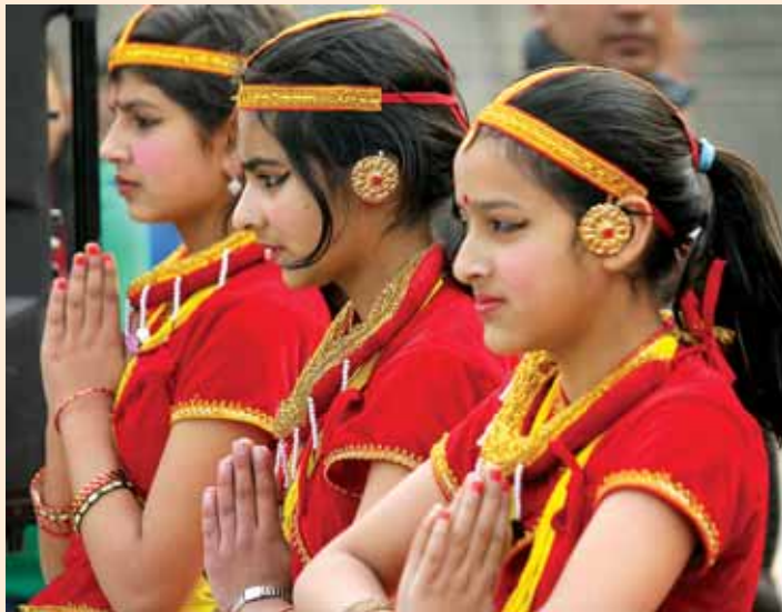
Panchakanya in traditional Nepali attire welcoming all the participants before inauguration of the Volunteer Caravan in Kathmandu