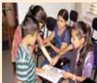
Children painting in KCC

After a brief presentation about volunteerism and examples that children can easily find around them in daily lives, the participating children played a game of passing a table tennis ball in groups. This game was to pass a small ball by using a spoon not using hands. As the ball is small and can move, all the children should be careful not to lose the ball when passing the ball to next child. When the neighbor child is smaller, then the child should kneel down to pass and receive the ball properly and quickly. All the children who participated enjoyed the game, and they understood immediately how to make the group work succeed and how important it is to see their neighbors around to have a harmony in working and living together within a group and a community. All the paintings from Damak and Kathmandu were sent to UNV HQ. Through this project, more children could think again about volunteerism and volunteers and express their knowledge and experiences by painting them. All the paintings of the children around the world were exhibited on September in the UNV HQ in Bonn.