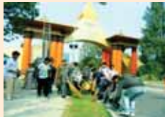
Hon'ble Minister for Civil Aviation and Tourism, Mr. Khagendra Biswakarma inaugurating the event.

As part of the celebration of IYV +10, coinciding with the Global Youth Service Day (GYSD), more than 1450 youth volunteers gathered at the Tribhuvan International Airport in Kathmandu to organize a Cleaning Campaign with the slogan 'Change through Volunteerism'. The participants cleaned the international airport premises and demonstrated their volunteerism. As part of the same campaign, two cleaning events were organized on April 30 and May 17 of 2011 jointly by the Ministry of Civil Aviation and Tourism, AYON (Association of Youth Organizations in Nepal), YUWA, UNV Nepal, Management Circle of Purbanchal University, Airlines Operators Association of Nepal with the coordination and cooperation of Airport Security Department.