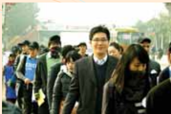
KOICA volunteers marching in the Caravan