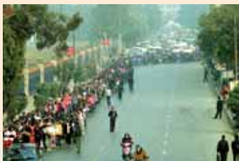
Volunteer Caravan Marching the Kathmandu City