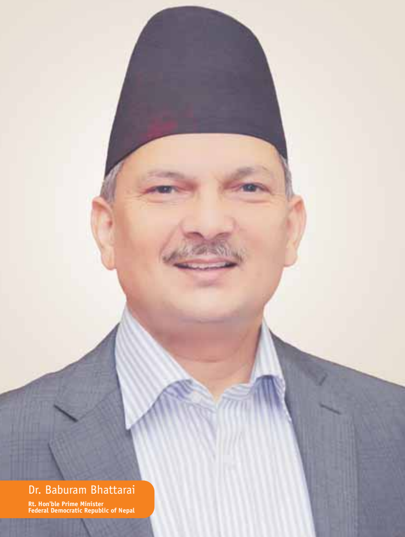
Dr. Baburam Bhattarai

Rt. Hon'ble Prime Minister Federal Democratic Republic of Nepal