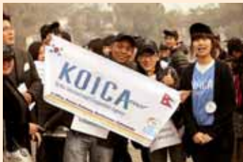
KOICA Volunteers in the Volunteer Caravan