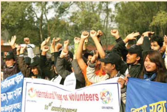
Volunteers showing their solidarity towards volunteerism