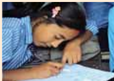
Student participating in the event

Each of the six trainings at the schools encountered high interest, as well as active and enthusiastic participation on behalf of the students. The feedback from the schools and all the other actors involved was thoroughly positive. While for the public school students, these workshops were an important occasion to better understand peace and conflict resolution at the national and at the personal level, the most important and fruitful part of the project was the capacity-building of youth volunteers. Through their role as committed trainees and as skillful trainers, they acted as peace-builders, mediators and facilitators, and will hopefully continue to do so beyond the frame of the project. Particularly in the context of IYV+10, this project showcased the large potential of mobilizing youth volunteers for conducting peace education on a broad scale.