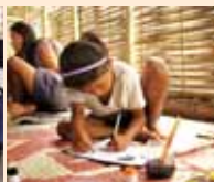
Children painting in Damak Refugee Camp