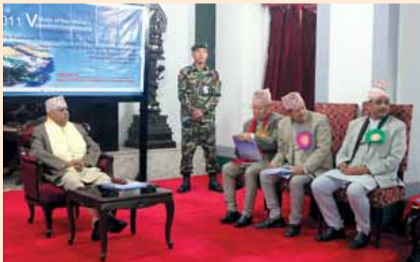
State of the World's Volunteerism Report Launch Programme: Rt. Hon'ble President of Nepal, Dr. Ram Baran Yadav (in the left) with other dignitaries