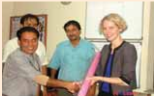
Ms. Emma Reynolds has returned to the UK and is currently European Minister of Foreign Affairs.

As part of the VSO Nepal program, each year a sort term political volunteer comes to Nepal to provide expertise on how to advocate/influence policy level development based on the needs and lessons learned on the ground in Nepal. This year, Emma Reynolds joined the education team to strengthen advocacy in girl's education, interact with policy makers as well as provide technical support to strengthen advocacy platforms. Emma was the UK foreign shadow minister and is currently EU foreign shadow minister.