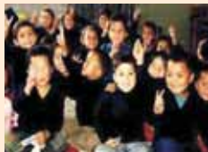
Support to School Children