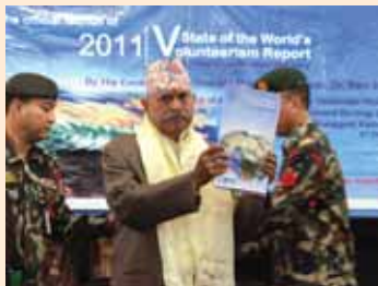
Rt. Hon'ble President of Nepal, Dr. Ram Baran Yadav, launching the “State of the World’s Volunteerism Report (SWVR) 2011” in Nepal

The “State of the World’s Volunteerism Report 2011” was launched in Nepal with a very high level programme in Office of the President of Federal Democratic Republic of Nepal, President House, Kathmandu, Nepal.