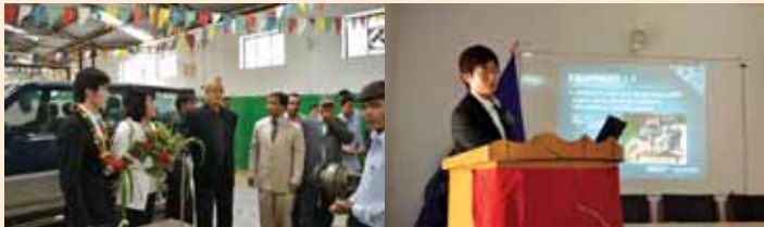
Welcoming KOICA representatives in the new equipment handover program