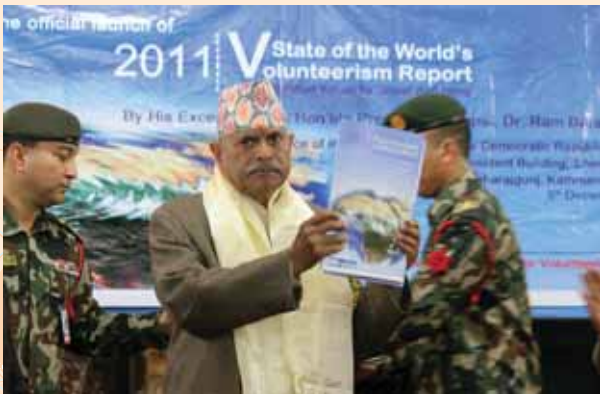
Rt. Hon'ble President of Nepal, Dr. Ram Baran Yadav launching the first ever "State of the World's Volunteerism Report (SWVR) 2011" in President House, Kathmandu, Nepal