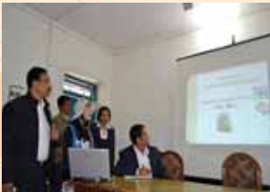
KOICA volunteer explaining about the project concept

The concept of this project is to encourage the families to breed goats and pigs and then handover the new born to another family. She encouraged the families to keep this cycle of distributing the new born in the coming days. Similarly, under this project, 100 toilets and a biogas system were built for the community. She was actively involved in the environment awareness campaign in the area throughout the year.