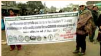
Volunteer Caravan in Nepalgunj