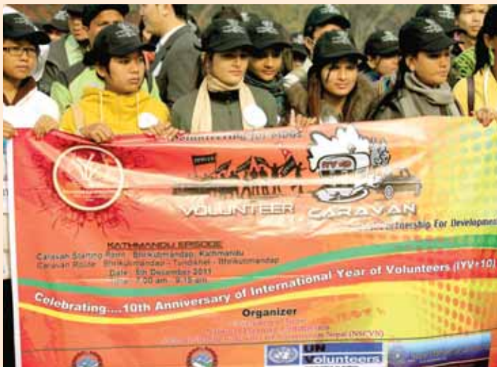
Volunteers carrying the Caravan flag