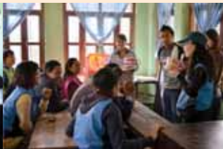
Volunteers teaching about tooth brushing method in Kirtipur