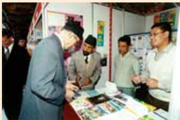
Veteran political leader, Late Mr. Girija Prasad Koirala visiting the exhibition (He was the former president of Nepali Congress Party and 5 times Prime Minister of Nepal)

The UN General Assembly held on November 20, 1997 passed a resolution that was proposed by the 123 countries, including Nepal, to proclaim 2001 as International Year of Volunteers. The objectives of International Year of Volunteers 2001 (IYV) were recognition, facilitation, promotion and networking of volunteer sector.