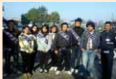
Volunteers with Traffic Personnel in Traffic Management Program in Kathmandu

Service for Souls (S4S) is a weeklong volunteering program conducted from 22 nd Nov to 5 th of December, 2011. S4S literally means providing service to the needy ones with full devotion and passion. The Millennium Development Goals (MDGs) was set in 2000 with the purpose of making Earth a better place to live in. Volunteerism can be used as a tool for the achievement of MDGs. Eight Areas has been identified under it where volunteerism can contribute to MDGs.