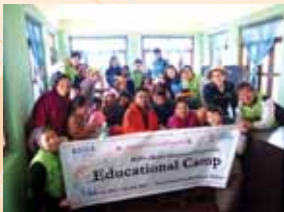
KOICA Volunteers participation in Education Camp

A total 18 volunteers actively participated in the Educational Camp which was conducted in both Kirtipur and Baglung. Volunteers conducted many activities with an aim to raise awareness in school children about environment and health issues. These camps also included recreational activities for the school children. Similarly, they managed to organize a medical camp for the community where more than 100 people were facilitated with acupuncture treatment.