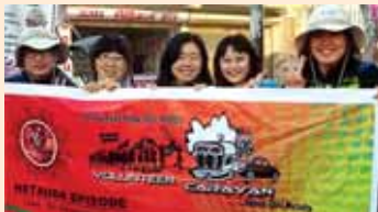
Volunteer Caravan in Hetauda