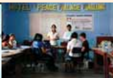
Conducting a training program which is under the cooperation between KOICA and JICA for Special education teachers

KOICA and JICA volunteers who are working in the sector of special education organized a joint teachers training program for the teachers and parents of the mentally retarded children. The training program included sessions in physiotherapy, behavioral techniques, various teaching methods, etc. Volunteers also managed to give orientations to the parents on taking care of mentally retarded children at home. These volunteers conducted this training in four places: Baglung, Birendranagar, Dharan and Kathmandu.