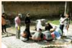
Students Planting Flowers