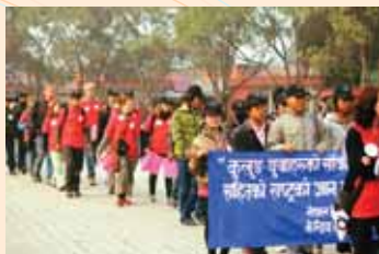
Volunteers starting Volunteer Caravan in Kathmandu