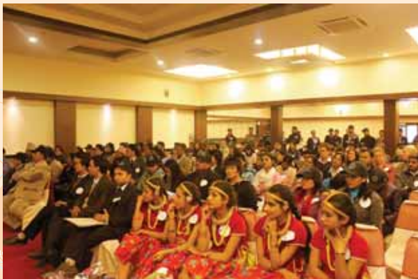
Participants in the conference