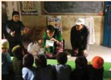
JICA volunteers teaching in schools of rural communities in Nepal

Japan International Cooperation Agency's volunteer program is a cooperation scheme to develop and reconstruct the society and economy of the recipient country. This program, based on the Japanese people's voluntary activities, aims to promote change in the awareness and attitude of the local residents at the grassroots level through cooperation with them and exchanging ideas, knowledge skills and learning with each other. Such cooperation also promotes deeper understanding of cultures and traditions and establishes lasting friendship between the volunteers and their hosts/counterparts.