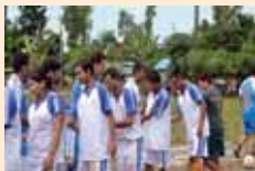
Volunteers shaking their hands before match