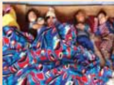
Support for Orphanage