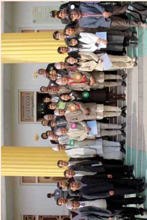
Group Photo with Rt. Hon'ble President of Nepal, Dr. Ram Baran Yadav after launching SWVR in President House, Kathmandu, Nepal